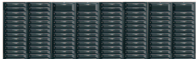
Figure 2: Enterprise modular storage arrays allow IT to start very small and scale to achieve enterprise-level capacity, availability and performance